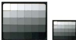
24 patch grayscale Customer C Pico and Nano targets,